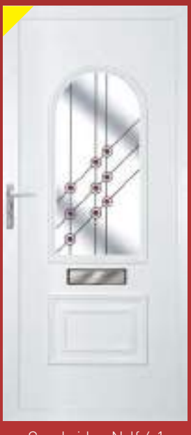
Cambridge Nrlf 6.1