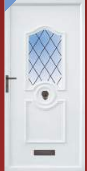
Ripon Diamond Lead