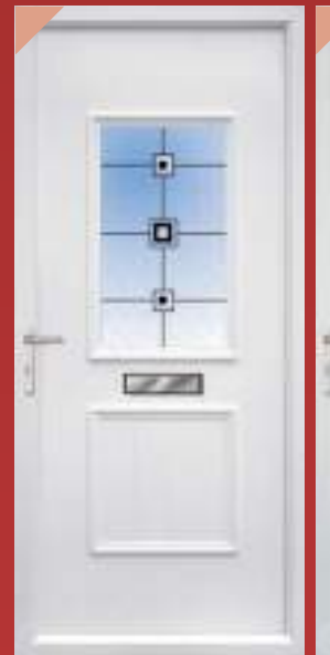
Selby Nfg 8.1