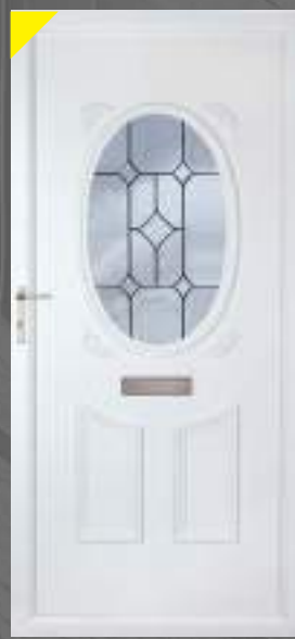
Oxford Ntb 17.1