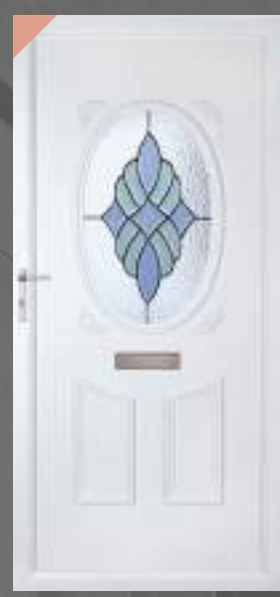
Oxford Ntb 7.1