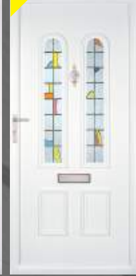
Norwich Nlt 20.2