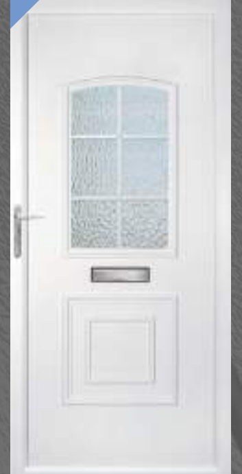
Durham Georgian Bar