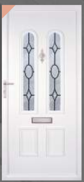
Norwich Ntb 19.2