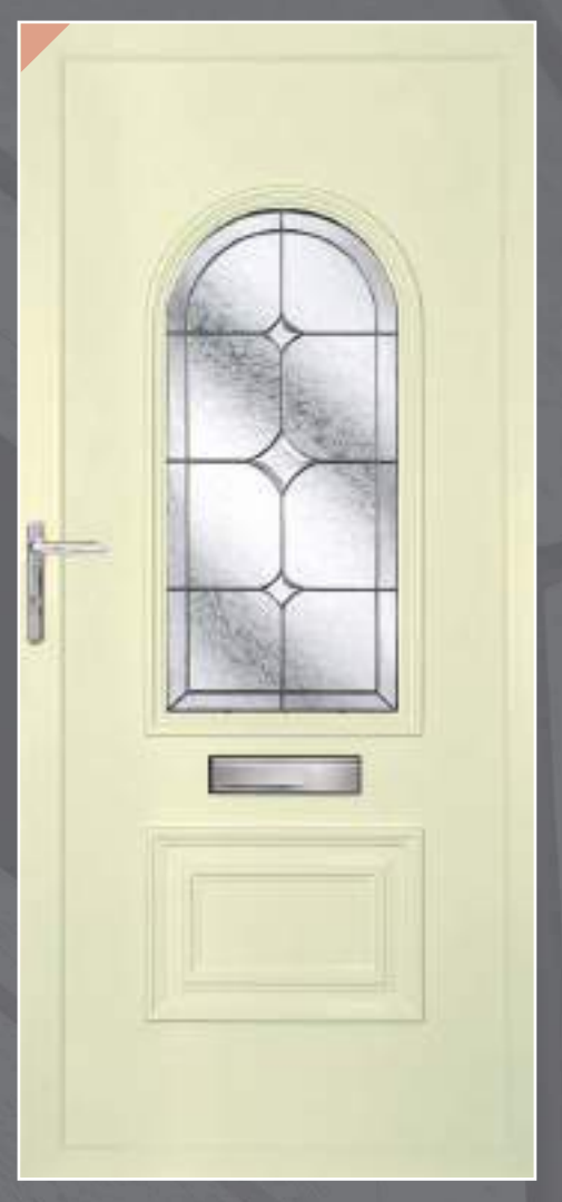
Cambridge Ntg 3.1 in Cream