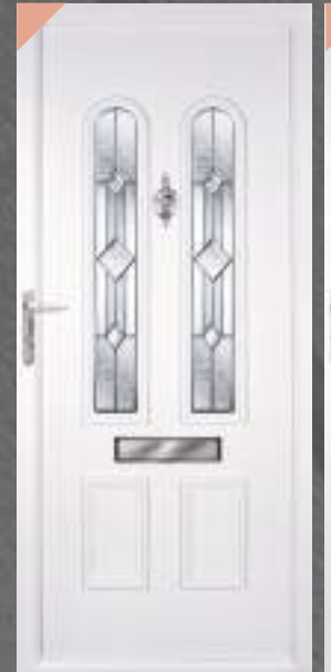
Norwich Nta 1.2