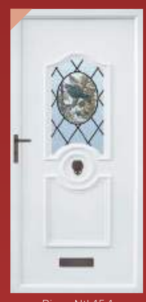
Ripon Ntl 15.1