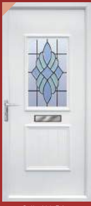
Selby Ntb 7.1