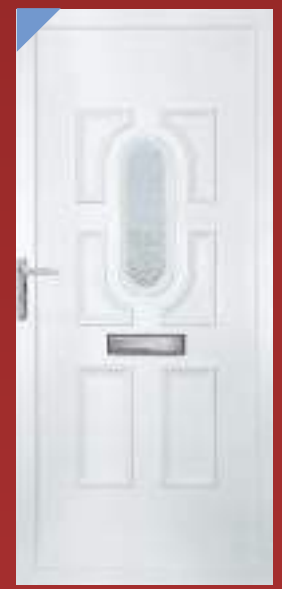
Coventry Small Obscure