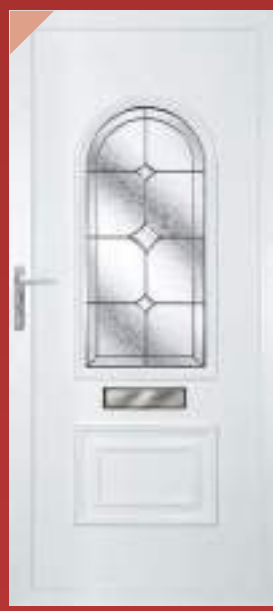
Cambridge Ntg 3.1