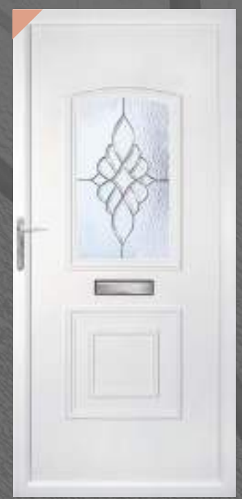
Durham Ntb 2.1