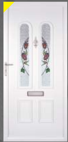
Norwich Nlt 21.2