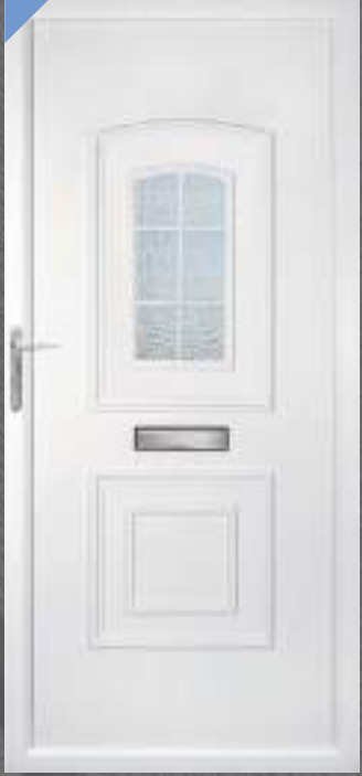
Durham Small Georgian Bar