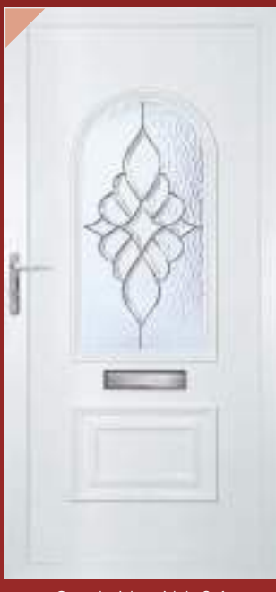
Cambridge Ntb 2.1