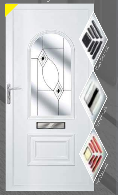
Cambridge Nrlf 5.1 Black & White