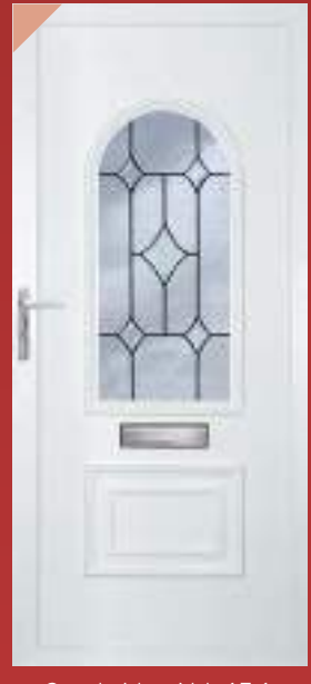
Cambridge Ntb 17.1