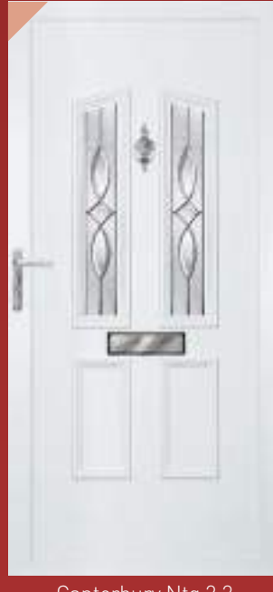
Canterbury Ntg 2.2