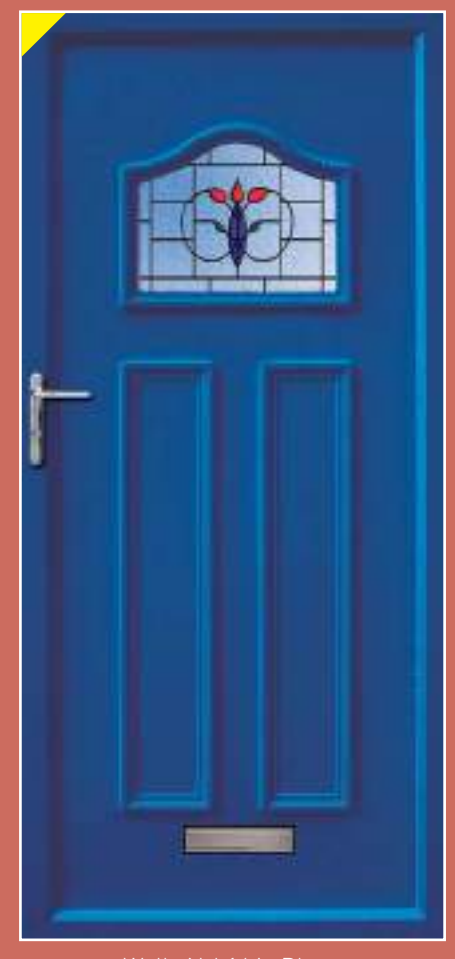
Wells Nrl 16 in Blue