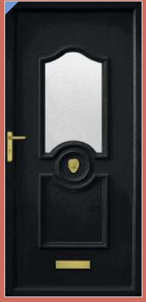
Ripon Obscure in Black