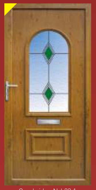
Cambridge Nrl 23.1