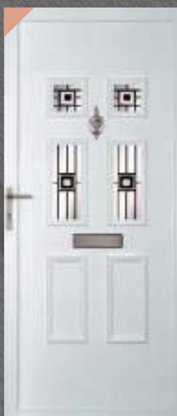
York Nft 3.4