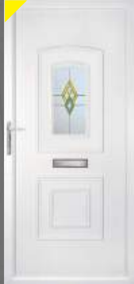
Durham Ntb 5.1