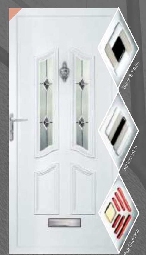
Beverley Nst 1.2 black