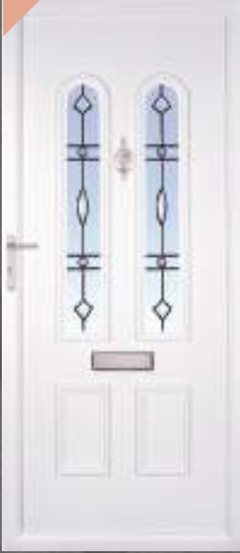
Norwich Ntb 4.2