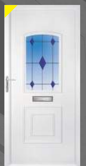
Durham Nrl 21.