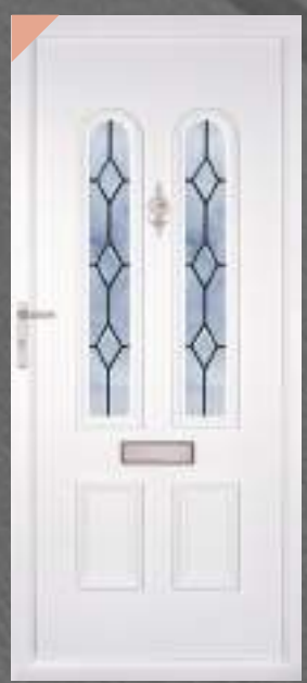
Norwich Ntb 18.2