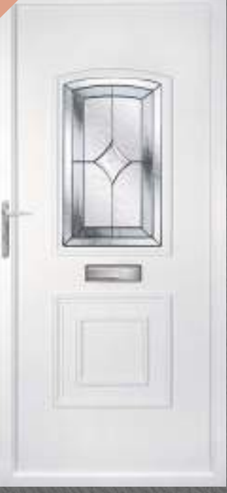
Durham Ntg 4.1