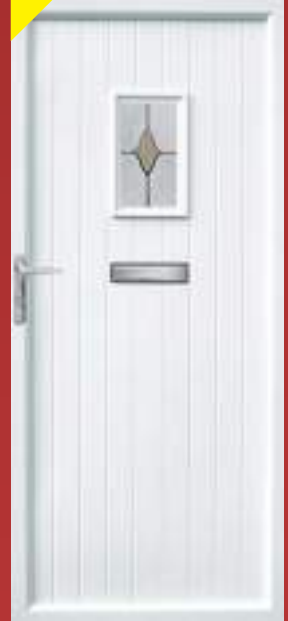
Ely Ntb 20.1