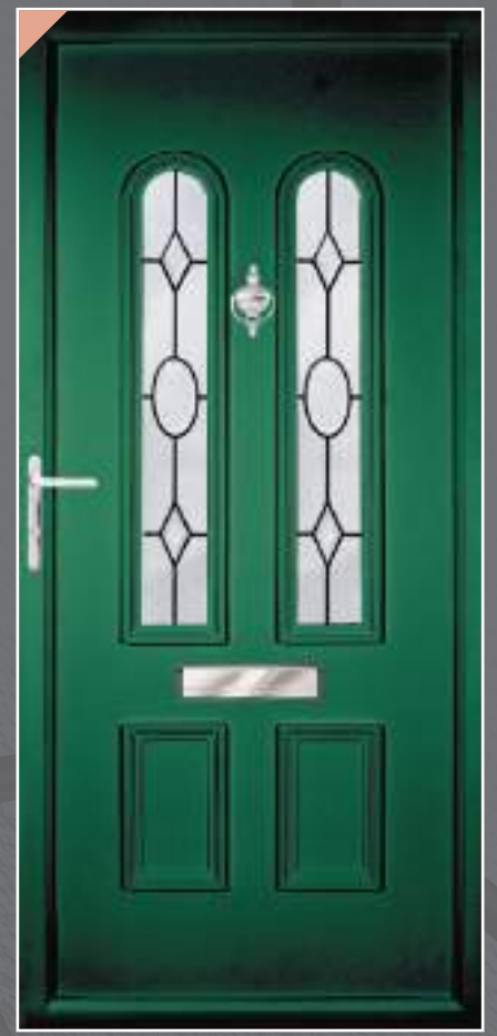
Norwich Ntb 19.2 in Green