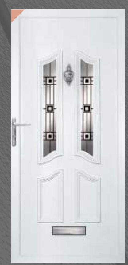
Beverley Nft 2.2