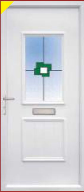
Selby Nrl 11.1