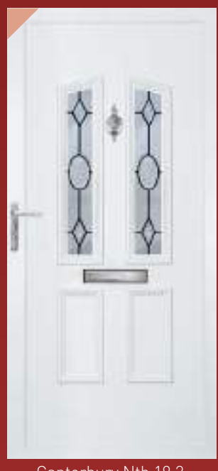
Canterbury Ntb 19.2