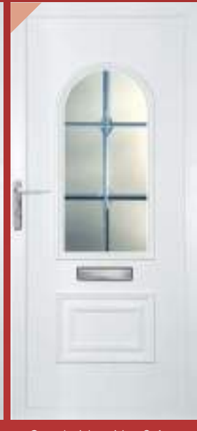
Cambridge Nst 3.1