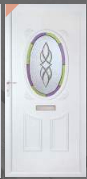
Oxford Ntb 3.1