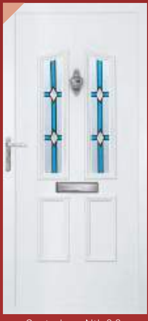
Canterbury Ntb 8.2