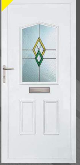
Winchester Ntb 5.1