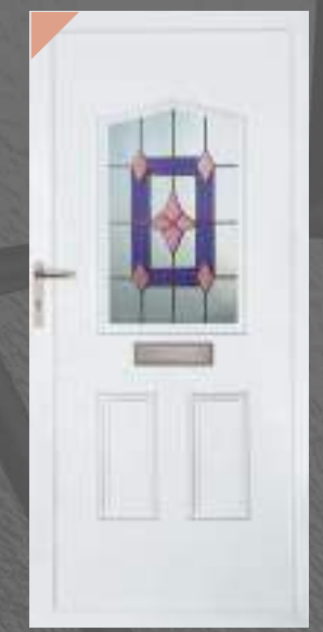
Winchester Nth 9 1