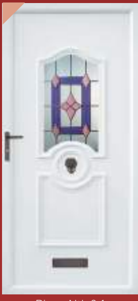
Ripon Ntb 9.1