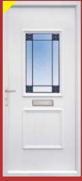
Selby Nrl 19.1