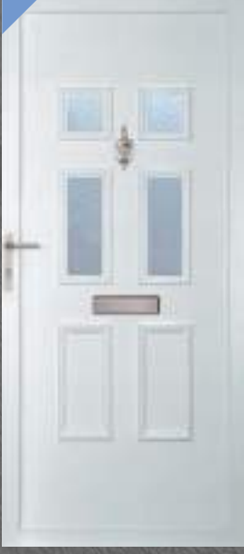
York 4 Obscure