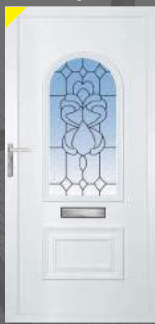
Cambridge Nrl 20.1