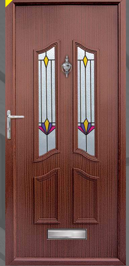
Beverley 2 Ntl 3.2