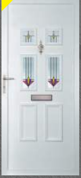
York Ntl 36.4