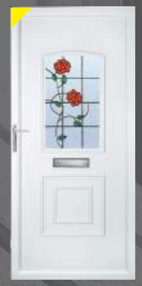
Durham NTl 18.1