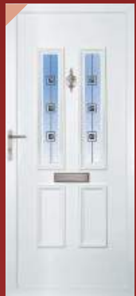
Lincoln Nfg 9.2