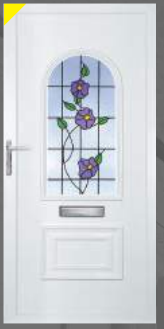
Cambridge Ntl 26.1