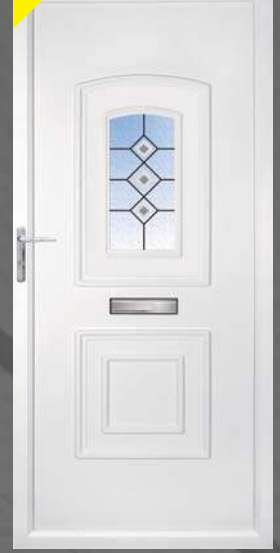
Durham Nfg 11.1