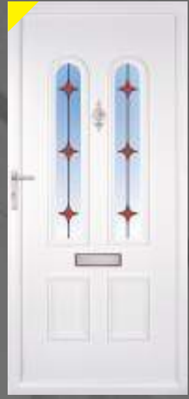
Norwich Nrl 12.2