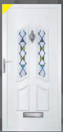
Beverley 2 Ntl 2.2