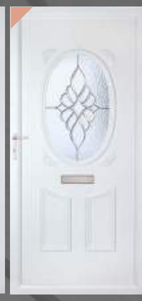
Oxford Ntb 2.1