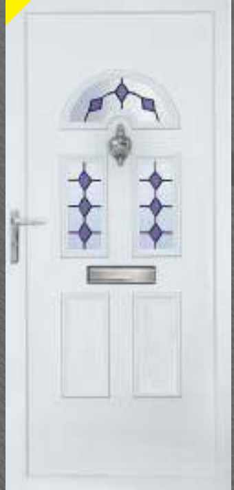
Lancaster Ntl 7.5