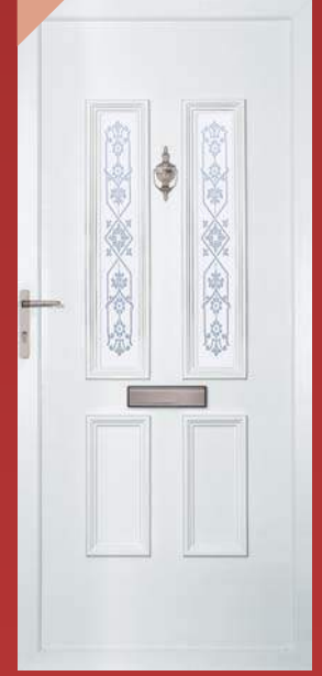
Lincoln Nsb 2.2