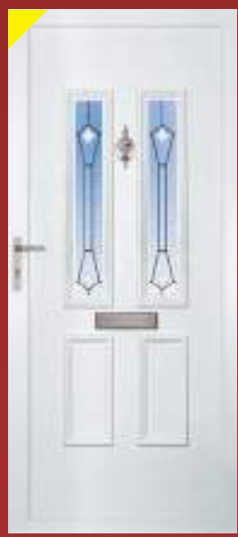
Lincoln Nfg 10.2