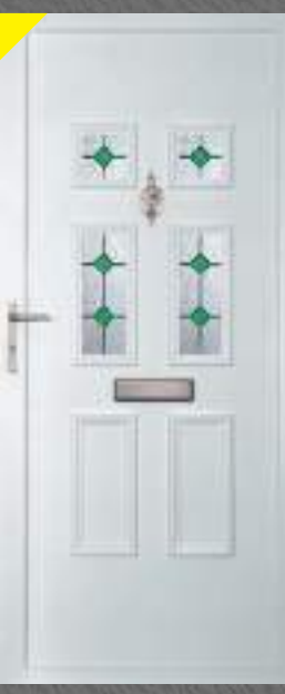
York Ntl 17.4