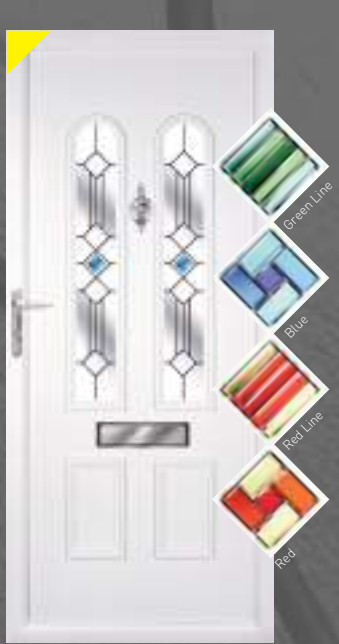
Norwich Nrlf 1.2 Blue Line