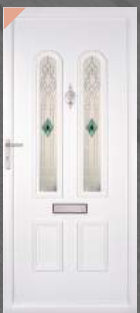
Norwich Nfg 2.2