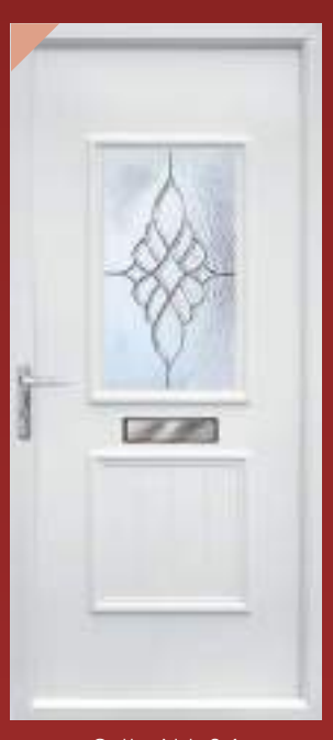
Selby Ntb 2.1