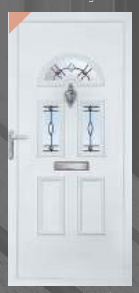
Lancaster Ntb 4.3s

Choose your colours carefully and much like the interior of your home