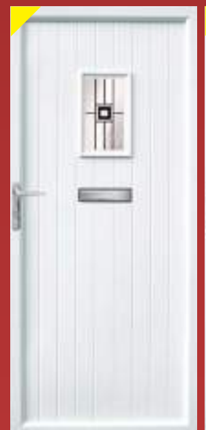
Ely Nft 1.1