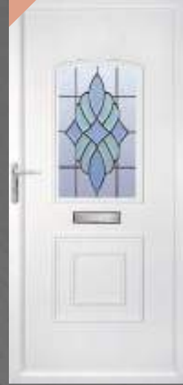
Durham Ntb 7.1