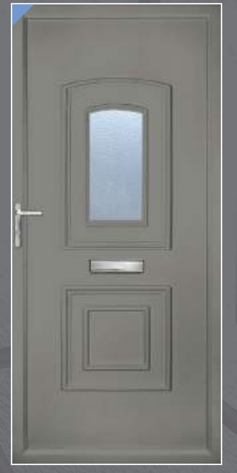
Durham Obscure in Grey