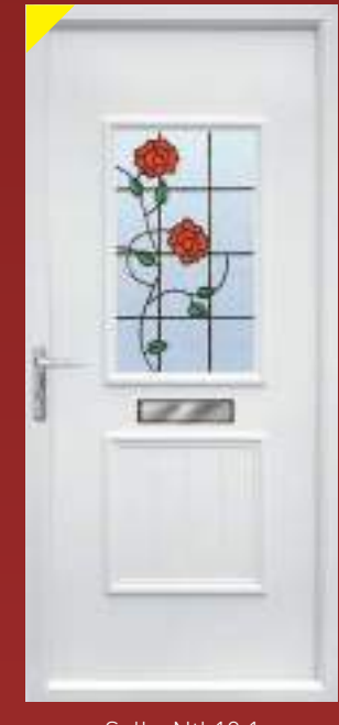
Selby Ntl 18.1