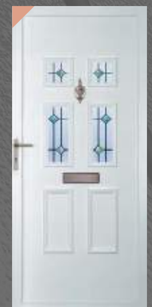
York Ntb 12.4