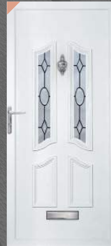
Beverley Nth 19 2