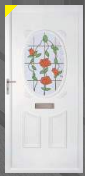
Oxford Ntl 10.1