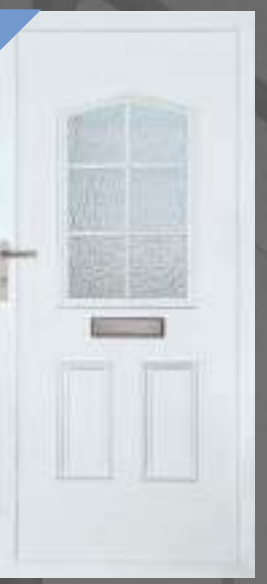
Winchester Georgian Bar