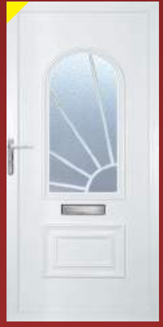
Cambridge Nab - sb White Only