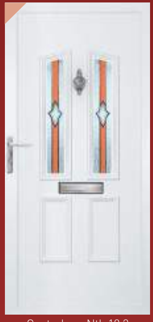
Canterbury Ntb 10.2