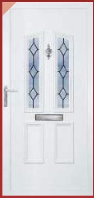
Canterbury Ntb 18.2