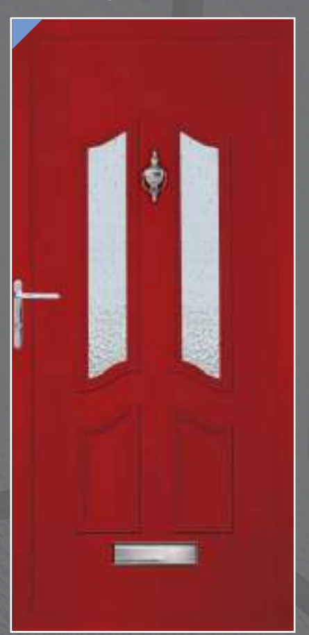
Beverley Obscure in Red