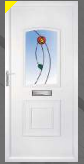
Durham Nrl 22.1