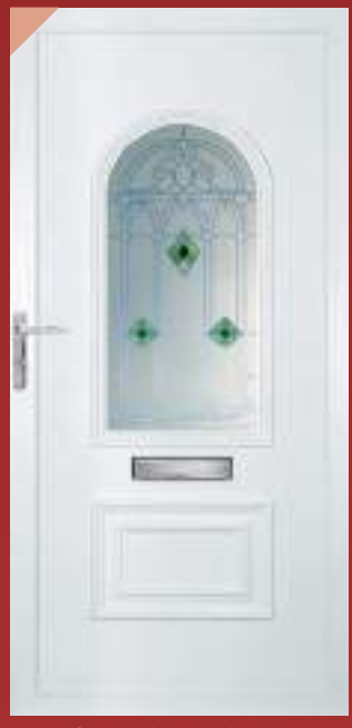
Cambridge Nfg 4.1