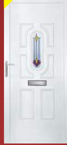
Coventry Ntl 5.1