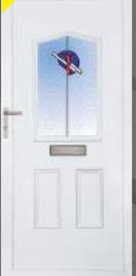
Winchester Nrl 15.1