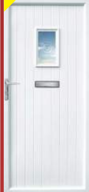
Elv Bulls Eve