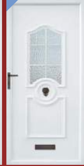
Ripon Georgian Bar