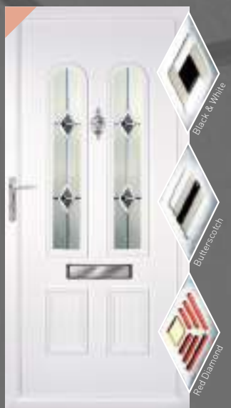
Norwich Nst 1.2 black